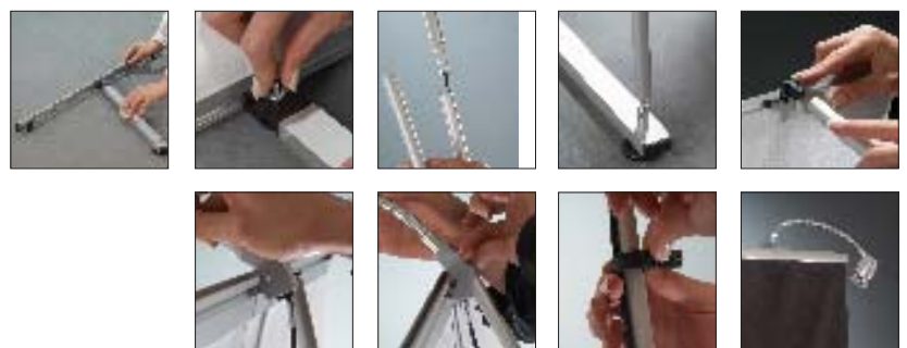
Patent No. TR 2005 01772